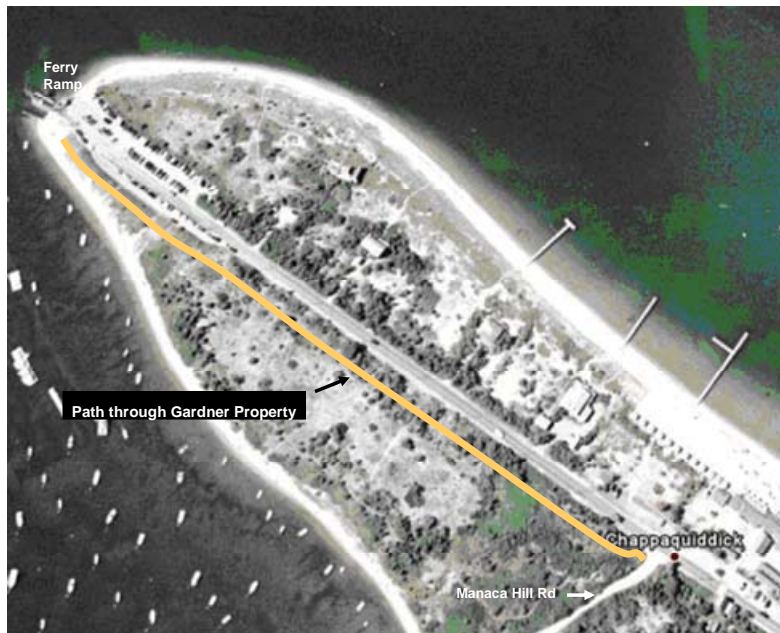
Figure 4. Diagram of demonstration path through Gardner property (0.27 miles).

The benefits of this approach are substantial.